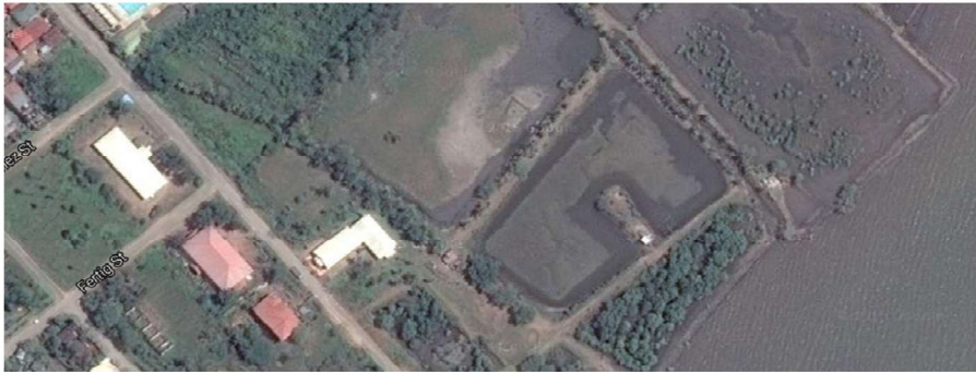
Figure 2. Location map of the two transect lines established in sitio Lucas, Maloro, Tangub City, Misamis Occidental.