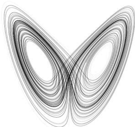
Figure 1. Lorenz Attraction with \rho = 28, \sigma = 10, \beta = 8/3